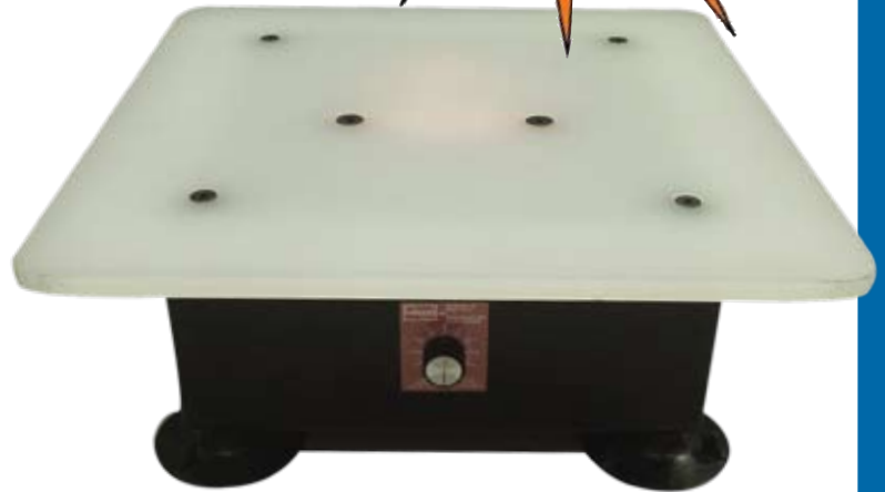
PJT-100 with Wear Resistant Deck