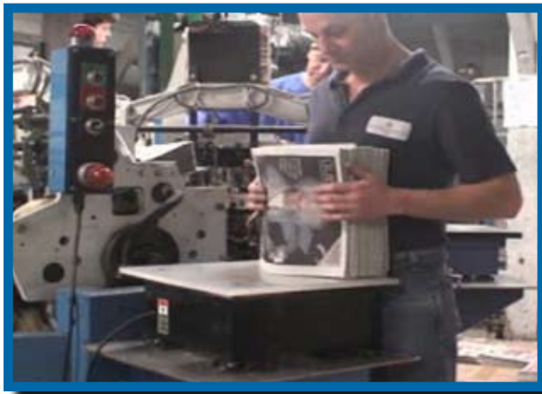
Westerly Sun (Westerly, RI) employee using PJT-100 to align inserts.